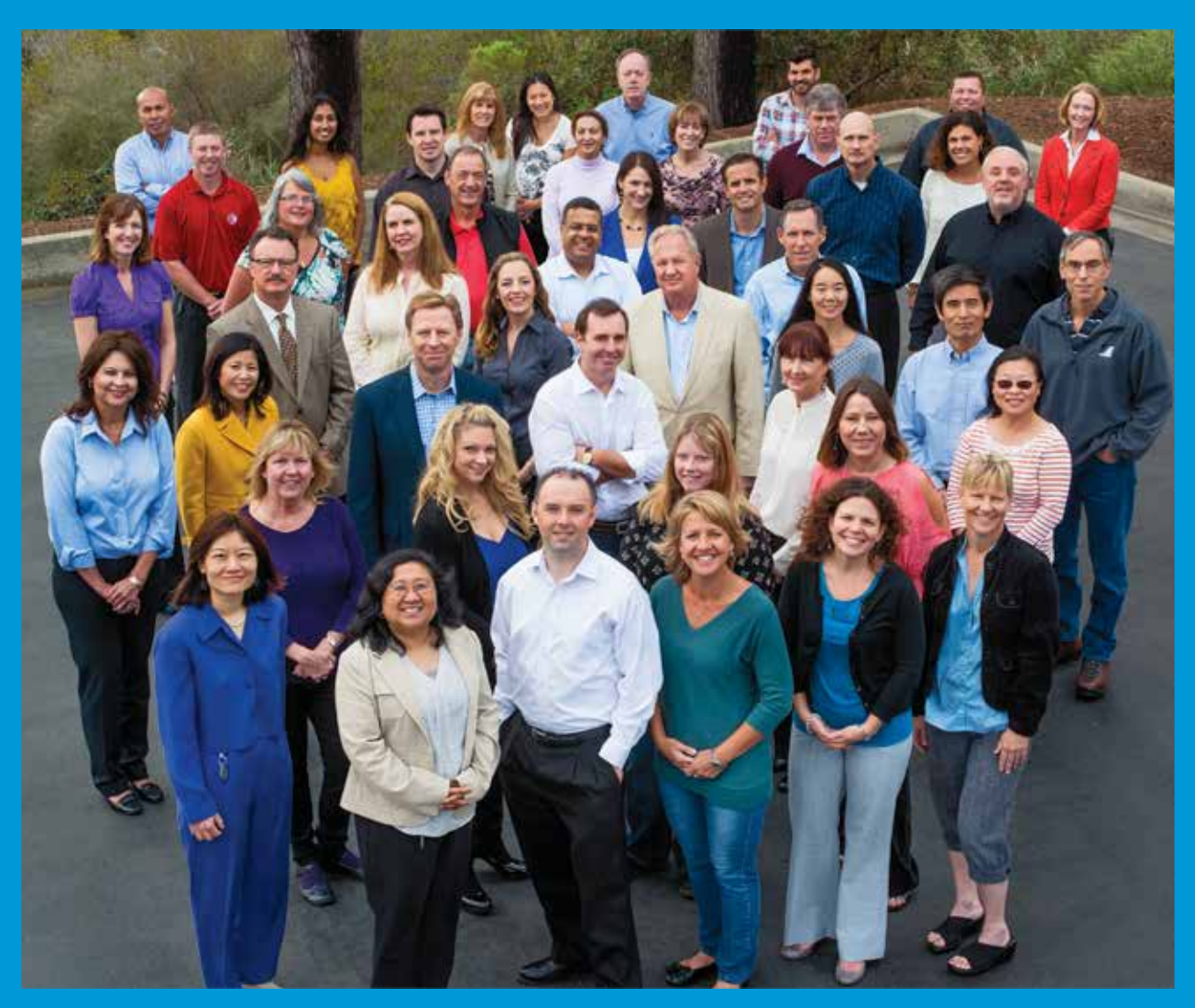
At ACADIA, we take pride in developing innovative treatments to address large unmet medical needs in neurological and related central nervous system disorders. We are committed to making a meaningful difference in the lives of patients with CNS disorders and the family members who take care of them every day.