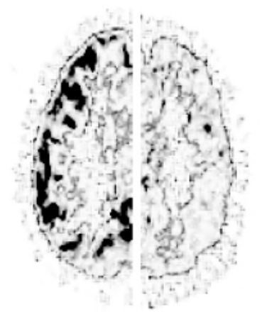
Figure 1: Composite of Two Human Brains Demonstrating High 5-HT2A Receptor Occupancy of ACP-103

Figure 1 is a composite of PET images of two human brains. The left half of the figure is from a subject given placebo, and the right half of the figure is from a subject given a single five milligram dose of ACP-103 that yields an estimated plasma drug level of approximately three nanograms per milliliter. This dose leads to significant occupancy of 5-HT2A receptors in the neocortex of the brain. Darker regions in the neocortex on the left half of the image show the PET-labeled 5-HT2A receptors. These receptors are not visible on the right because they are being blocked, or occupied, by ACP-103 treatment. Based on these PET data and the results of our Phase I and Phase Ib/IIa clinical trials, we believe that low doses of ACP-103 will be sufficient to demonstrate efficacy in our clinical trials.